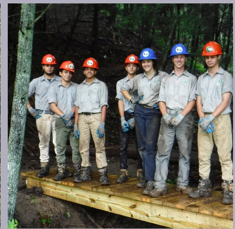
Left: CFPA Summer Trail Crew. Middle: AmeriCorps service group. Right: AMC Summer Teen Trail Crew.

TRAIL CREWS & PROJECTS: 2018 was a landmark year for trail crews on the NET! Both AMC and CFPA hosted their very own summer crews on the trail. AMC partnered for the first time with the City of Holyoke and the organization Mass Hire to employ five local youth for seven weeks on the NET. During their time on the crew they learned new skills and completed a wide variety of projects as they traveled along the trail, including installing signage, cutting switchbacks, and building bridges.