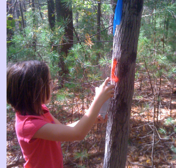
Jayde Surette painting trail blazes for the NET.

We have been working on some ways to protect the land around the NET, and on creating fun trail events for people of all ages. We are planning to protect 2.5 miles of the NET this year, and to hold at least 2 fun trail events.