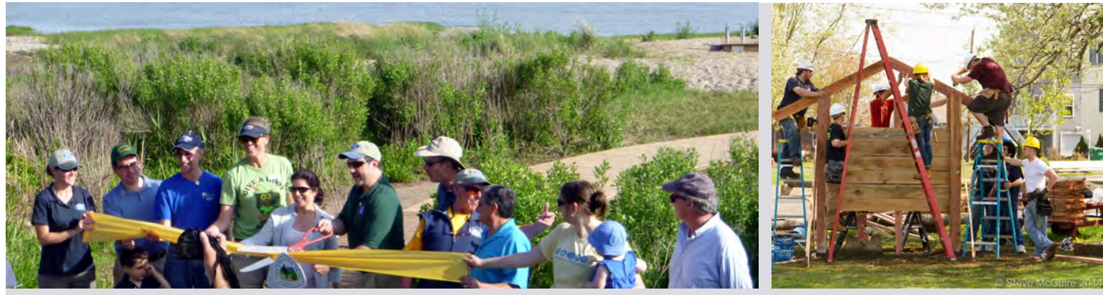
Opening the new boardwalk and building the kiosk at Chittenden Park in Guilford, CT.

SOUTHERN GATEWAY DEDICATED IN GUILFORD: The NET officially reached Long Island Sound at a National Trails Day dedication event in June at Guilford's Chittenden Park. The park now features a gentlycurved boardwalk over the dunes to an overlook platform. From the platform, walkers can view Falkner Island, Chaffinch Island Park, and the West River. A kiosk built by Guilford High's Advanced Woodworking students—and assisted by many hands—was installed at the park entrance. Twenty-three donors and in-kind contributors (plus countless partners, supporters & volunteers) made the project possible.