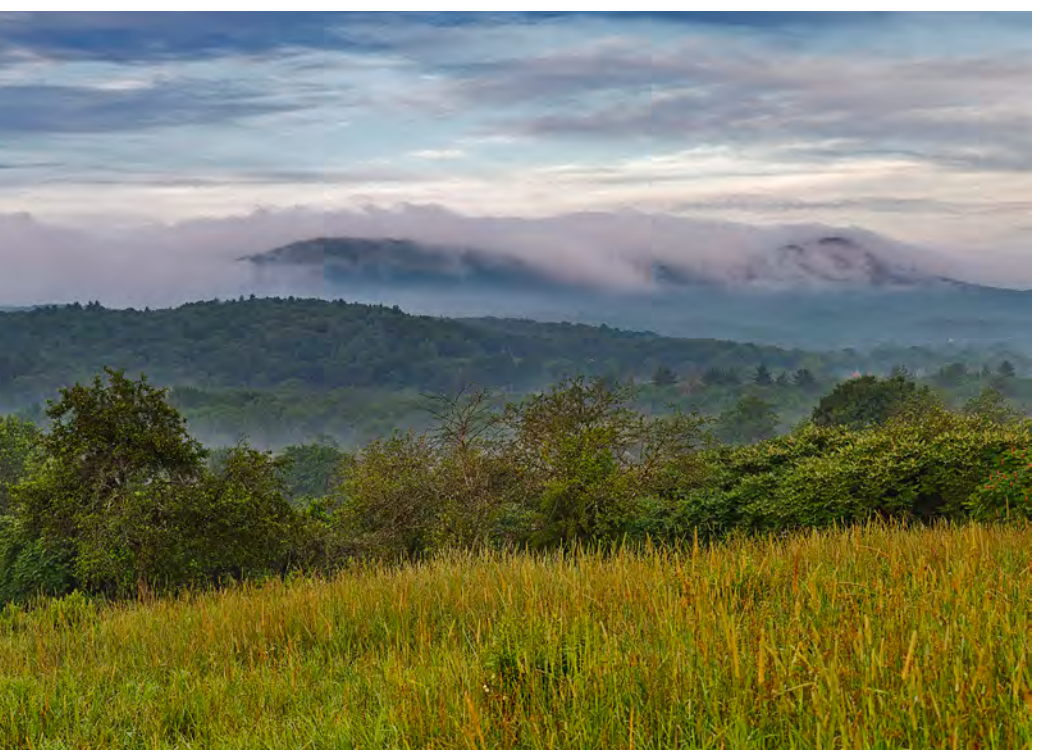
The cloud-draped Holyoke Range as seen from Mount Pollux in Amherst, Massachusetts on a July morning.