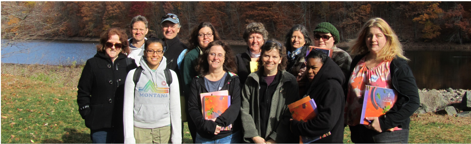
Local educators participated in CT's second Trails to Every Classroom Training. The group hiked the NET at Meriden's Giuffrida Park.

TRAILS TO EVERY CLASSROOM: This fall we partnered with the Hitchcock Center for the Environment to bring a series of field trips to the sixth grade classes in Amherst and Pelham, Massachusetts. Students learned about the geologic history of the region and hiked a portion of the NET in Skinner State Park. In Connecticut, the Farmington Alternative High School created a video called "Tales from the Trail" which tells the story about Will Warren's Den on Rattlesnake Mountain and the local flora and fauna.