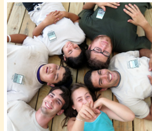
The Trustees of Reservations’ Holyoke Youth Conservation Corps (TTOR)

LONG-TERM TRAIL STEWARDSHIP: Thanks to generous funding from the Hartford Foundation for Public Giving, CFPA has begun meeting with local towns and trail supporters in the northern half of the state to begin developing a long-term strategy for trail protection. This multi-year project will identify trail sections that are especially vulnerable and help strengthen the NET’s landowner outreach for the northern half of the trail in Connecticut.