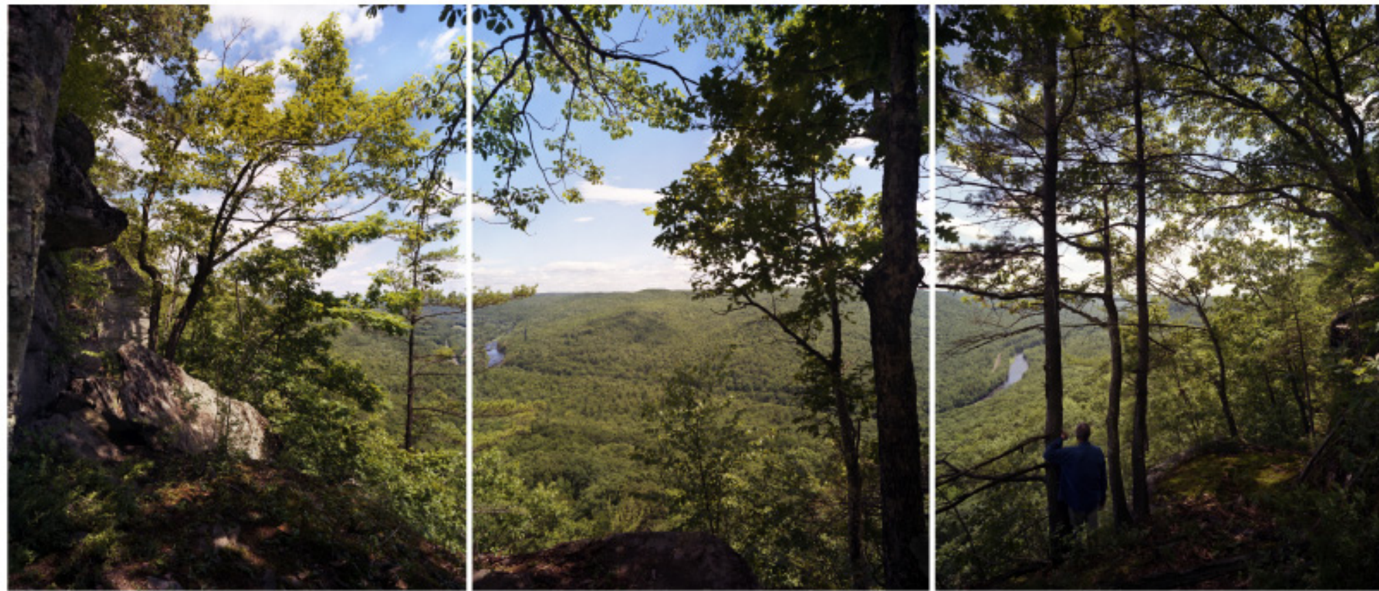
< Tryptich, Above Millers River, 2012 Barbara Bosworth

Welcoming Hikers 22 Trail events and 12 trail workdays; 3 Tent Platforms, 4 Trailhead Kiosks and 15 Trail Signs