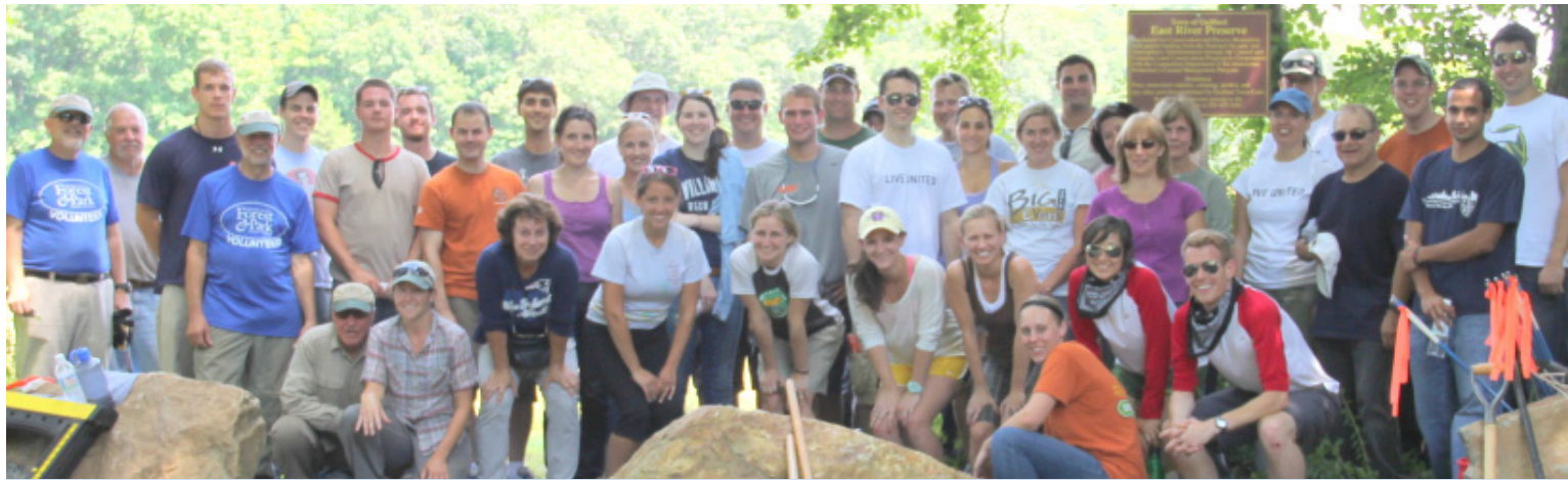
Trail volunteers from CFPA and the Guilford-based Sightlines company in the East River Preserve.

TRAIL RESTORATION AND TRAINING: In July, the NET was constructed through the East River Preserve in Guilford. With the help of more than 50 volunteers, over 30 cedar posts were installed over the Preserve's open and rolling fields for trail blazes. This new 2.5-mile segment enhances the trail experience near the NET terminus at Chittenden Park on the Long Island Sound.