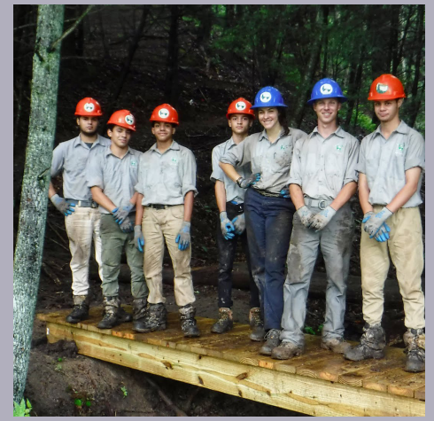
Left: CFPA Summer Trail Crew. Middle: AmeriCorps service group. Right: AMC Summer Teen Trail Crew.

TRAIL CREWS & PROJECTS: 2018 was a landmark year for trail crews on the NET! Both AMC and CFPA hosted their very own summer crews on the trail. AMC partnered for the first time with the City of Holyoke and the organization Mass Hire to employ five local youth for seven weeks on the NET. During their time on the crew they learned new skills and completed a wide variety of projects as they traveled along the trail, including installing signage, cutting switchbacks, and building bridges.